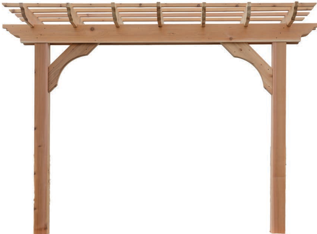
Pictured: 4 × 8 Cedar Inline Pergola