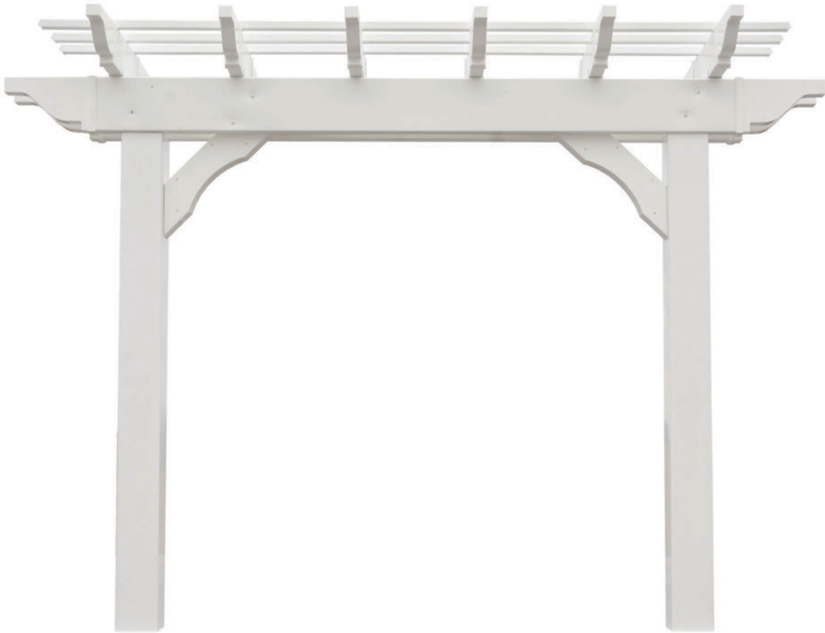
Pictured: 3 × 8 Vinyl Inline Pergola