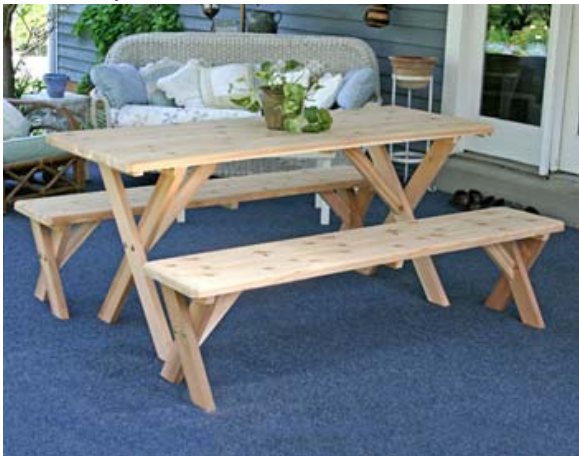
5 Foot Table Shown Above